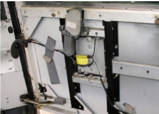
3. Bond or rivet the uprights into position.