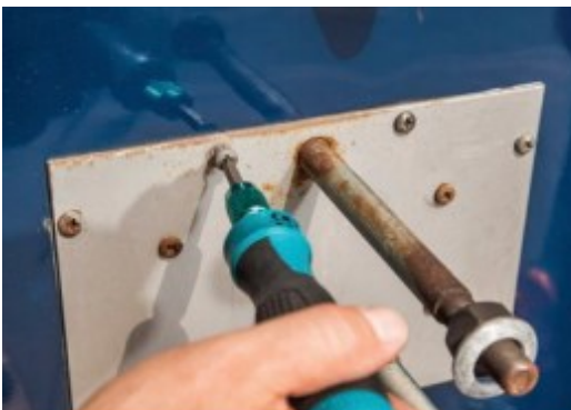
3. If your vehicle is pre 2002, you will need to remove the fixed head spare wheel carrier from the back door. Often, this will expose some corrosion, or paint defects.