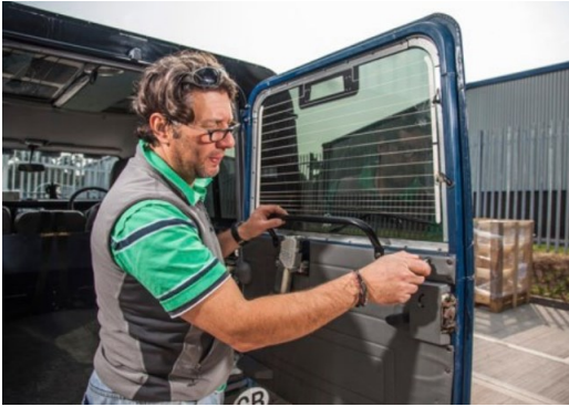
1. Remove the rear door trim.