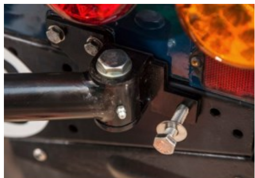
6. Attach bracket A of the spare wheel carrier in its position on the rear cross member by using the existing bolts. Please make sure, you use the gasket provided between the cross member and bracket A. Use the 100 mm length long bolt to secure the spare wheel carrier on to rear cross member.