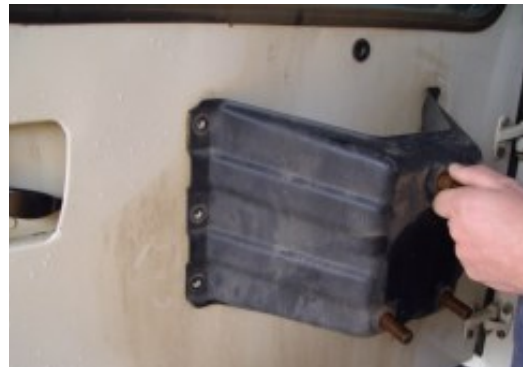
2. If your vehicle is post 2002 and already fitted with a factory fitted spare wheel carrier, remove the 6 nuts, bolts and washers from the existing spare wheel carrier and set a side for re-use.