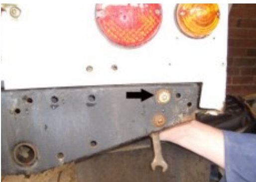
5. On 110 station wagons, you may have to remove the top bolt holding the seat belt retainer as shown. A new 100 mm long bolt is supplied if this bolt is missing or damaged on your vehicle.