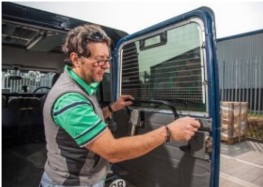
1. Remove interior trim panel from the door.