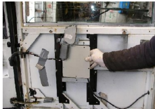
4. Use the square plates to cover the old spare wheel carrier holes, if there were any. You can use a bonding adhesive, rivets or nuts and bolts to secure the plate to the inside of the back door.