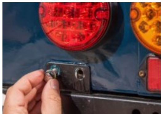
4. Remove the two cross member to body mount bolts on the right hand side.